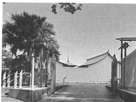
Entrance at 25 Woods Street