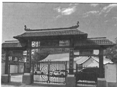
Entrance at 6 Litchfield Street

The venue can be accessed from both 25 Woods Street and 6 Litchfield Street, Darwin