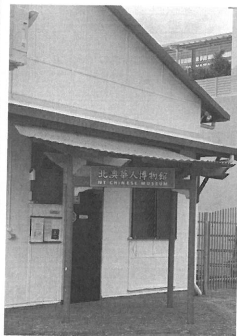
Above: NT Chinese Museum