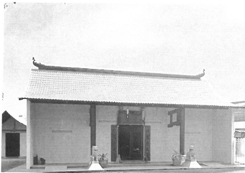
Above: Chinese Temple—Hall of Ranking Sages