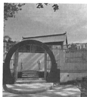
Temple entrance Woods Street