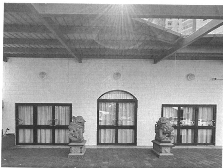
Left: Chung Wah Society Community Hall